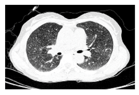
Fig. 2: HRCT Thorax showing Bilateral Reticulonodular Opacities and Interstitial Septal Thickening