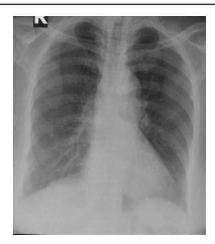
Fig.1: Chest X ray showing Bilateral Reticulonodular Opacities